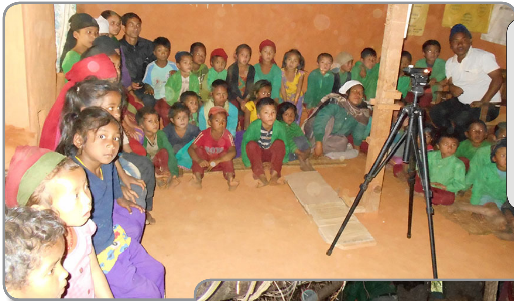
Left - Showing a slide show about orchard management to students from Baragaun Primary School at the Resource Centre. HPC uses a pico projector which is rechargeable and also able to be used in the remote vilages away from grid electricity.