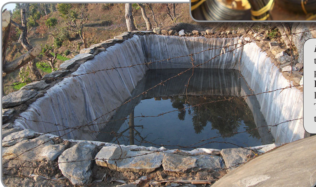
Left - a 30,000 litre water collection tank lined with heavy duty plastic, made by members of Pragatshil Group, Salgadi village, for their irrigation system. The water is fed to and from this tank via gravity.