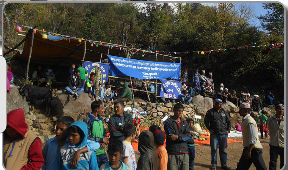
Right - the exhibition stall at the Farmers' Festival where groups and individuals bring farm produce or grains, vegetables, fruits and handicrafts to exhibit, and prizes are awarded.