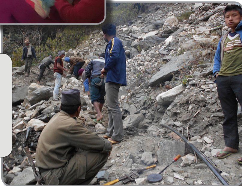
Right - members of Ujwal Group of Thulo Khaltakura involved in maintenance of their drinking water system. Because of the simple and local technology used by HPC, in particular not using cement in tank construction, village groups can maintain their own water systems with minimal cost and external input.