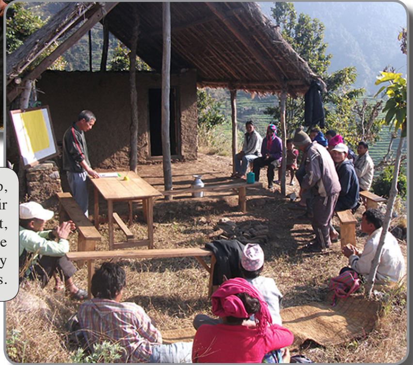
Right - members of Pragatshil group, Salgadi village, at the opening of their community building along with a toilet, seed drying area and nursery. They have made this with their own community contributions of labour and materials.