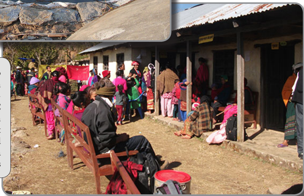
Right - participants queue up to attend a womens' health camp run by HPC in association with the district and VDC Health Office, at Neta High school in December 2014. At the camp 128 women received treatment and conselling for a variety of ailments