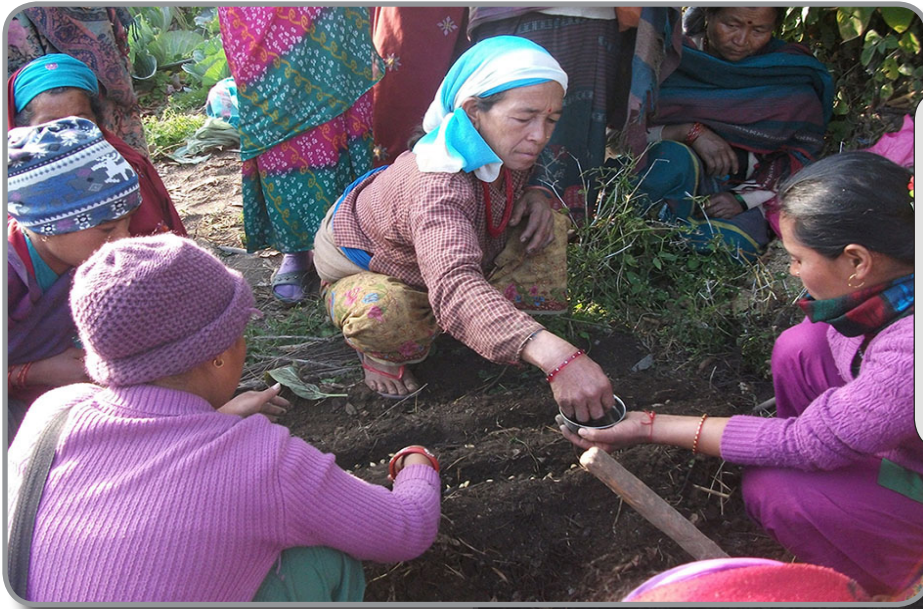
Left - participants of the practical literacy class (PLC) of Janasahayogi group, Subbatol village applying in practice what they have been learning to read and write - they will have learned the letters and word construction of "nursery" and then make one and sow seeds in a participant's garden