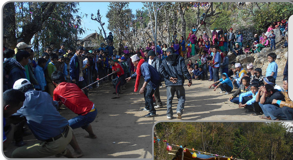
Left - participants of HPC's annual Farmers' Festival in March play tug-o-war in friendly inter-group competitions, including song, dance, theatre and sports. About 350 villagers attended the festival