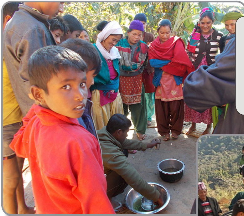
Left - at a mobile farmers' training, Jagaran group are shown how to collect, store and use human urine as a Nitrogen-rich resource for growing vegetables, mulching and compost making. This approach, pioneered in Nepal by DZI Foundation in Eastern Nepal, is a new chapter in the recently re-printed Farmers' Handbook .