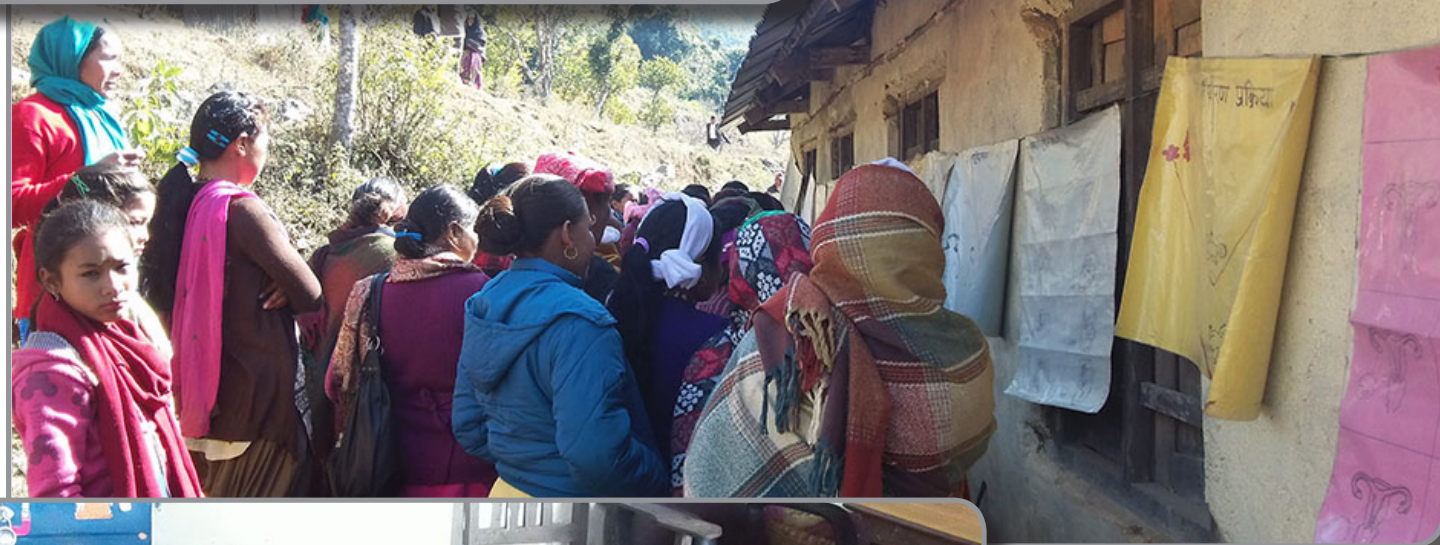
Below - attendees of the Women's health camp are provided with educational classes to augment their treatment and counselling - here being shown a poster display.