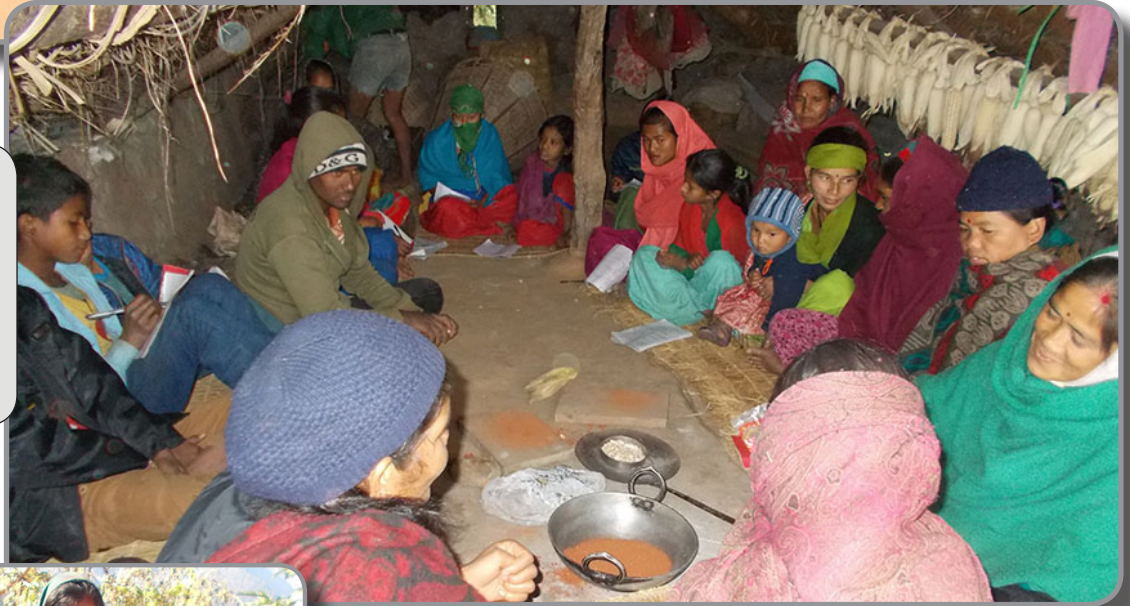
Right - participants from Jagaran group of Khaltakura village learn how to make a salt lick for livestock on a technical training