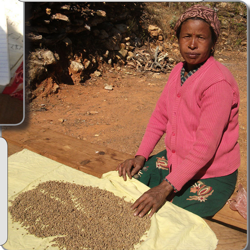
Right - a member of Himal group, Ghatu-tol village, with Swiss Chard seed she has saved for distribution amongst hers and other groups in Surkhet. Villagers have become competent at saving many types of seed and using them to grow healthy vegetables. HPC have also produced a short video, "Local Seeds, Our Future" about the value of saving local seeds.