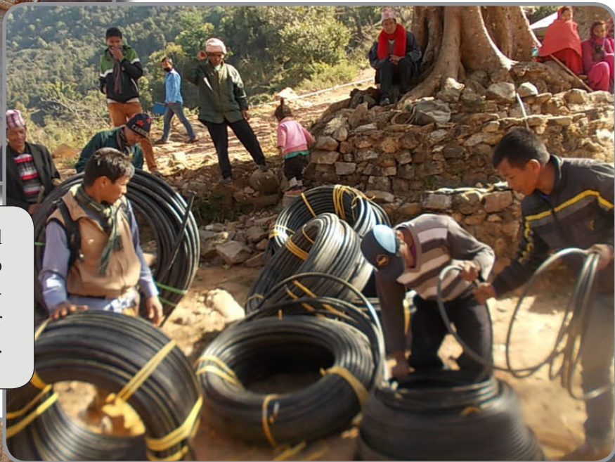
Right - pipe is collected from the road head by members of Janasahayogi group of Subbatol village for use in their irrigation system. They will carry the pipe for a day before reaching their village.