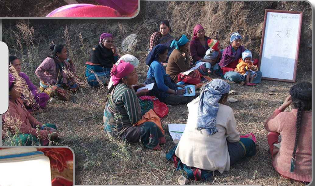
Right - members of Janasahayogi group, Subbatol during their PLC. The classes are held for 2 hours 5 days a week and continue for 9 months.