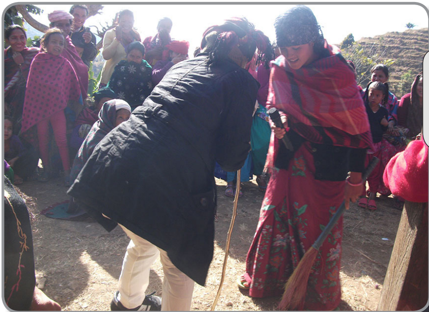
Left - group volunteers at the Women's Health camp act out a role play about women's health issues as theatre for the participants as they queue.