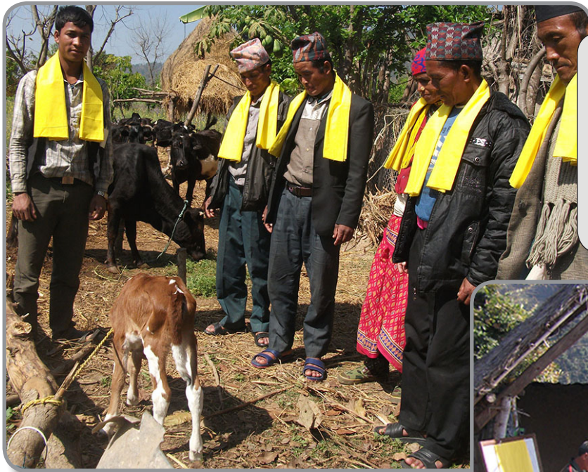
Left - farmers from Humla on HPC's annual Farmers' Field Trip from Humla to Surkhet where they get a chance to view various community and farming initiatives and innovations. Here they are seeing the new calf of a local cow bred with an improved variety of bull.