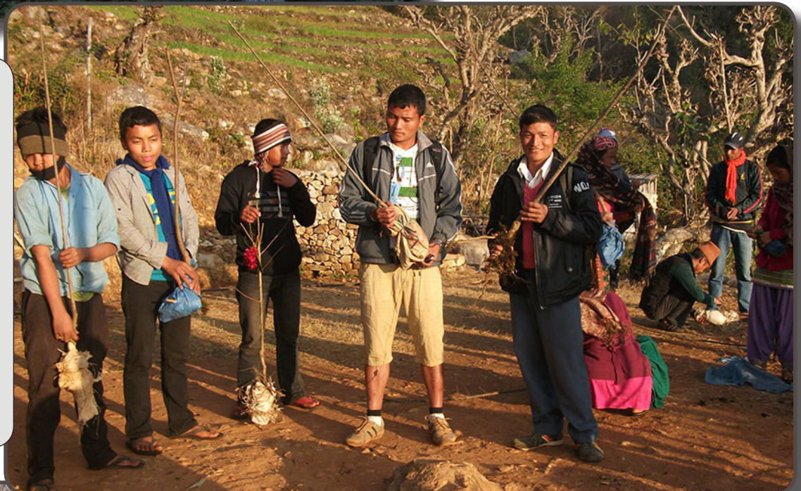
Right - villagers are provided grafted peach, apricot and pear seedlings for planting at home following their participation in a 5-day residential farmers' training at Baragaun Resource Centre in Surkhet. Planting and care of fruit seedlings is part of the course.