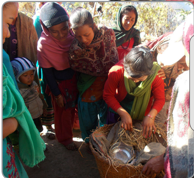
Left - participants of Jagaran group on a mobile farmers' training held in Sano Khaltakura village learning about the "Hay Box" - which acts like a thermos to conserve heat used to bring food to the boil until it is fully cooked, thus conserving fuel and reducing smoke. Food (rice, pulses, stew, etc.) is brought to the boil and placed in the hay box (a traditional basket packed with straw) where it continues to cook.