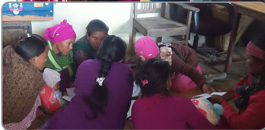
Left - attendees of the health camp receive counselling about their ailment, how it is caused and how it can be prevented and/or treated.